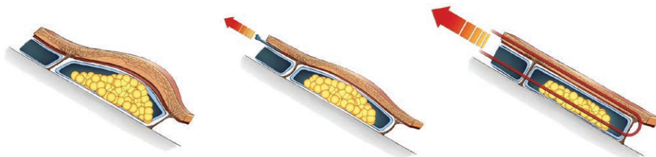
Fig. 1. A, Aging of facial structure with ligament loosening and fat pad ptosis. B, Effect of pulling SMAS with ptotic tissue lifting indirectly. C, Effect of pulling multi-layer of ptotic tissue directly.

There are 2 parts of MAMPS: a tri-loop for the facelift of the lower two-thirds followed by an ancillary postauricular double-loop for jaw line enhancement (see video, Supplemental Digital Content 1, which displays surgical techniques of thread-looping method "MAMPS." This video is available in the "Related Videos" section of the Full-Text article at PRSGlobalOpen.com or at http://links.lww.com/PRSGO/A929 ).